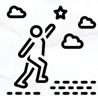
& lots of Courage